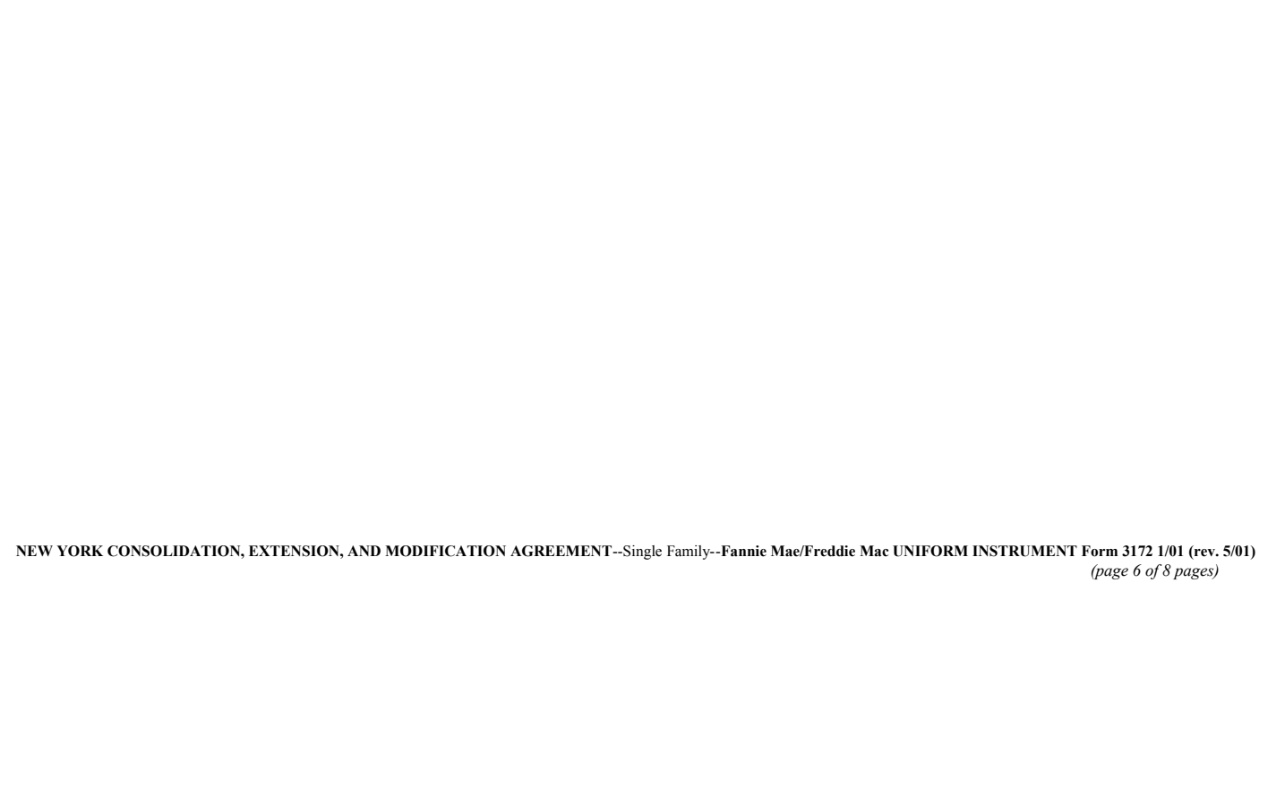
EXHIBIT B Property Description